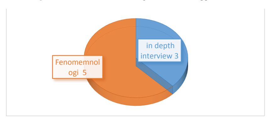
Fig. 2. Characteristics of the design and research approach

Based on research design, there were 8 articles used qualitative method i.e. 3 articles used in deep interview and 5 articles used phenomenology