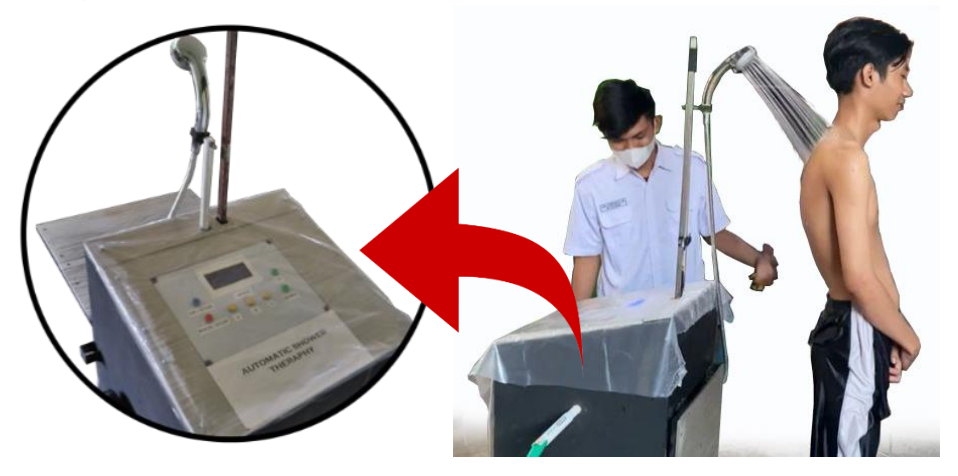
Figure 2. Photographic view of shower therapy trial

user's spine. The height or length of the shower movement can be adjusted according to the user's height, as presented in Figure 2 .