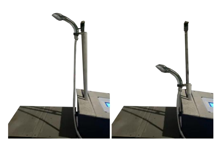
Figure 4. Maximum and minimum shower head position

A 12V linear DC motor 75cm long is used to drive the shower head. This motor is able to support the movement of the shower head so that it can spray water along the user's spine. In the control panel, the user can set how long to take a shower therapy bath. An overview of the maximum and minimum positions of the shower head can be seen in Figure 4 .