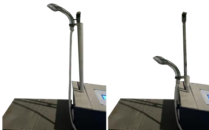
Figure 4. Maximum and minimum shower head position

A 12V linear DC motor 75cm long is used to drive the shower head. This motor is able to support the movement of the shower head so that it can spray water along the user's spine. In the control panel, the user can set how long to take a shower therapy bath. An overview of the maximum and minimum positions of the shower head can be seen in Figure 4 .