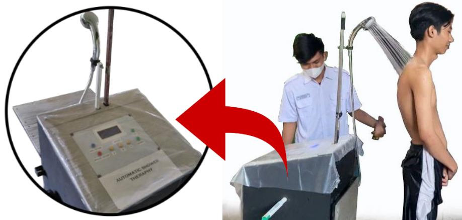
Figure 2. Photographic view of shower therapy trial

user's spine. The height or length of the shower movement can be adjusted according to the user's height, as presented in Figure 2 .