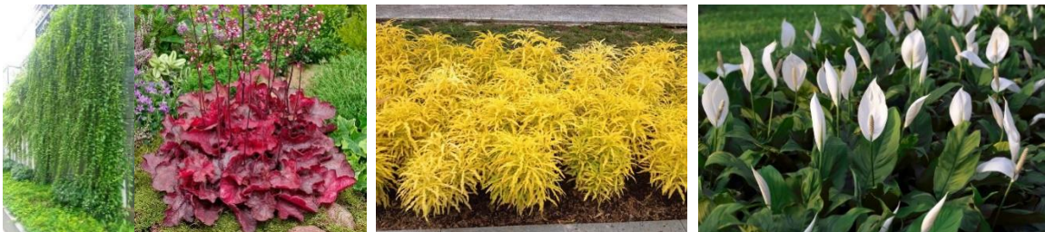
Figure 6. vegetation plan