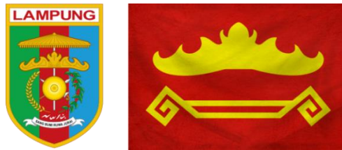
Figure 7. Typical colors of Lampung province

the sculpture to create a sense of oneness between the aluminum and natural elements. The following plants are employed to enhance the visual impression by showing the traditional Lampung hues of red, yellow, and white. Red heuchera, yellow broccoli, and white peace lilies are among these plants. The plants are organized in a tuffaceous pattern to blend in with the sculpture design, which includes cultural themes. The sculpture geometry is also given a typical Lampung color to strengthen the authentic impression inherent in Lampung culture. The sculpture geometry is also given a typical Lampung color to strengthen the authentic impression inherent in Lampung culture from the play of yellow and red colors that dominate, as seen in Figure 7.