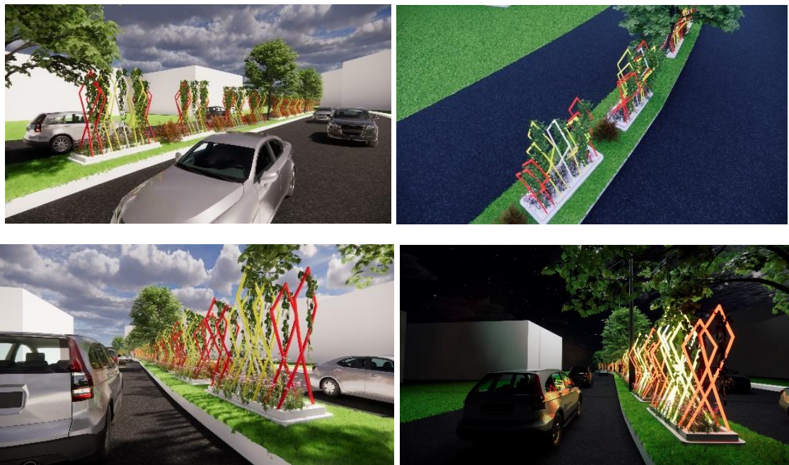
Figure 8. Design Concept of Road Median