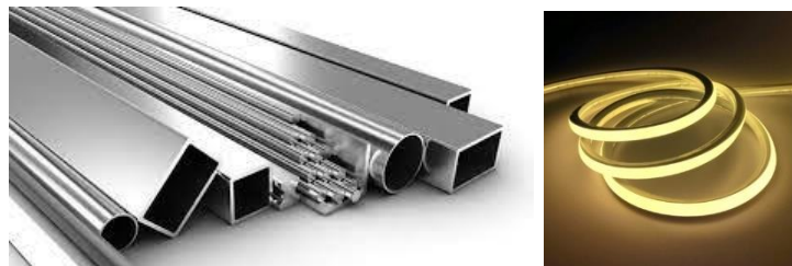
Figure 5. aluminum and led strip

In order to maintain the concept of sustainability in the design, the sculpture material will be made using aluminium material with the consideration that aluminium material has a high level of elasticity, is easy to shape, can be disassembled and is lightweight. Aluminium material is also easily available in the market at a fairly affordable price. Maintenance is also quite easy because the aluminium material has a fairly good material strength against mechanical stress. Aluminium is also the main material in LEED certified buildings and buildings with sustainability. LEED / Leadership in Energy and Environmental Design, can be defined as Leading in Energy and Environmental Design.