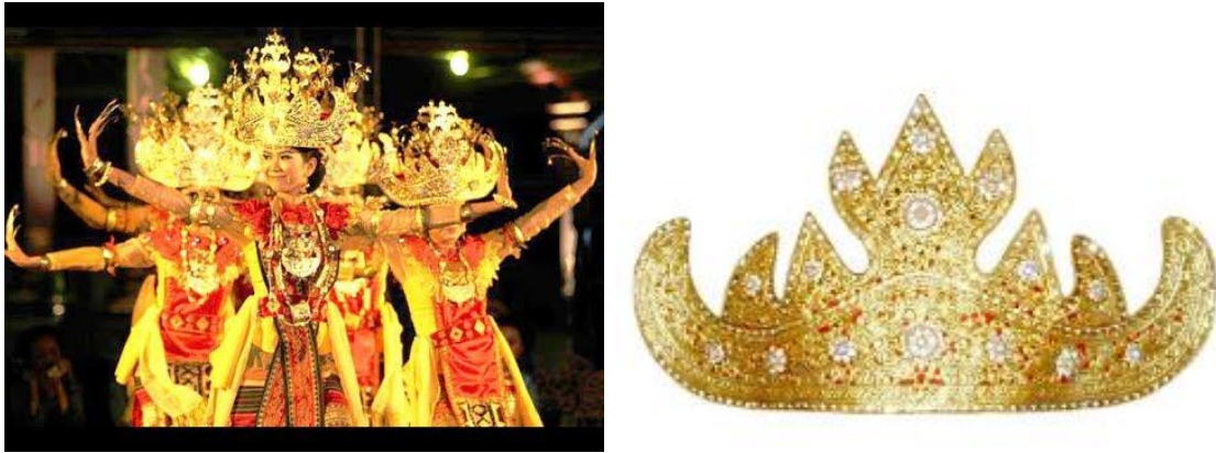
Figure 4. Lampung traditional dance and siger formation