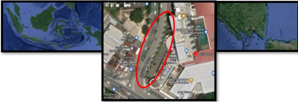
Figure 1. Road median design location