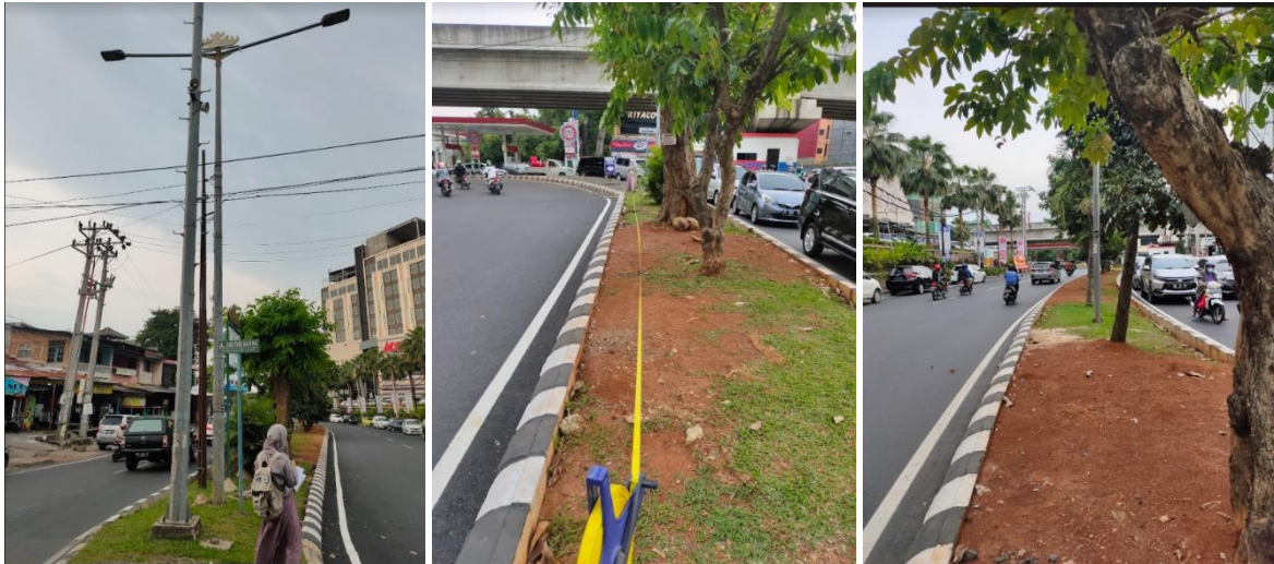
Figure 2. Road median design location