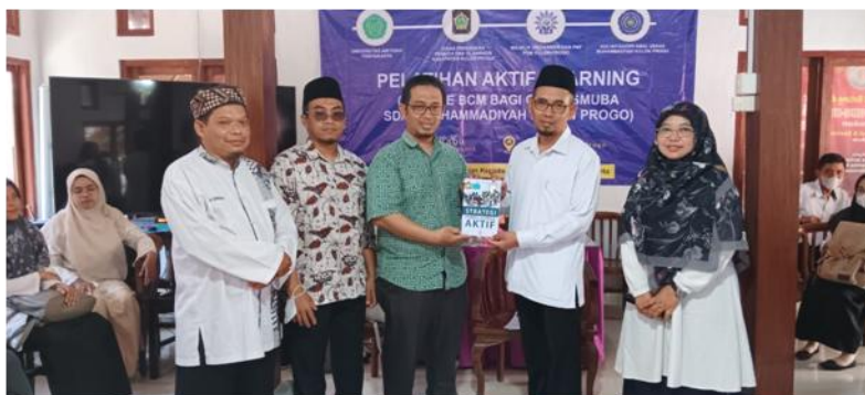
Figure 2. Documentation of activities