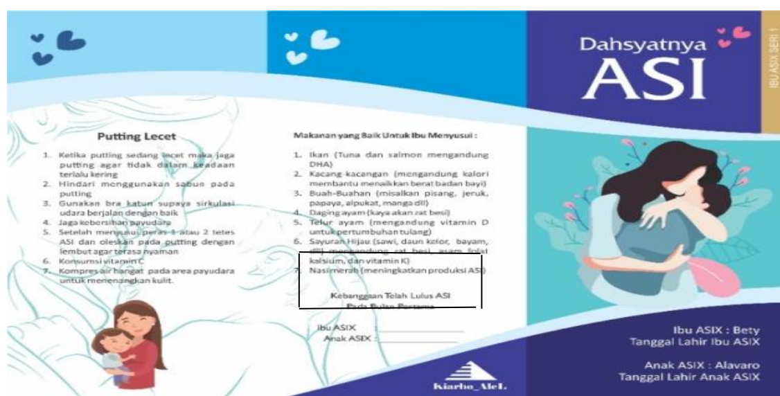
Figure 8. Pride Column

The existence of this innovative leaflet media provides additional motivation for mothers of toddlers in achieving exclusive breastfeeding for their baby. Mothers get knowledge about the benefits and importance of breast milk for their babies, mothers get information what if the child is not given exclusive breastfeeding, mothers get information on how to smoothen breast milk and overcome problems that might occur in nursing mothers.