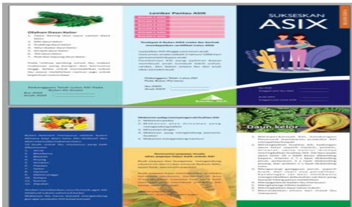
Figure 6. Serial Leaflet 6

This leaflet is designed as a healthy health card owned by each baby to monitor their growth and development. This leaflet has an identity column where this column is made so that the mother has the responsibility or obligation to provide exclusive breastfeeding to her baby. The hope is that this identity column will increase the motivation and confidence of mothers to provide exclusive breastfeeding.