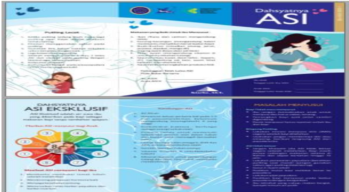
Figure 1. Serial leaflet 1

From the problems found in the diagnosis stage, researchers have formulated the problem of the need for increased knowledge both of the baby's mother and the posyandu cadre. Efforts to increase knowledge have been created serial leaflets about exclusive breastfeeding. In the second stage, researchers have created a 6 series leaflet, which provides information on how to achieve exclusive breastfeeding in each month.