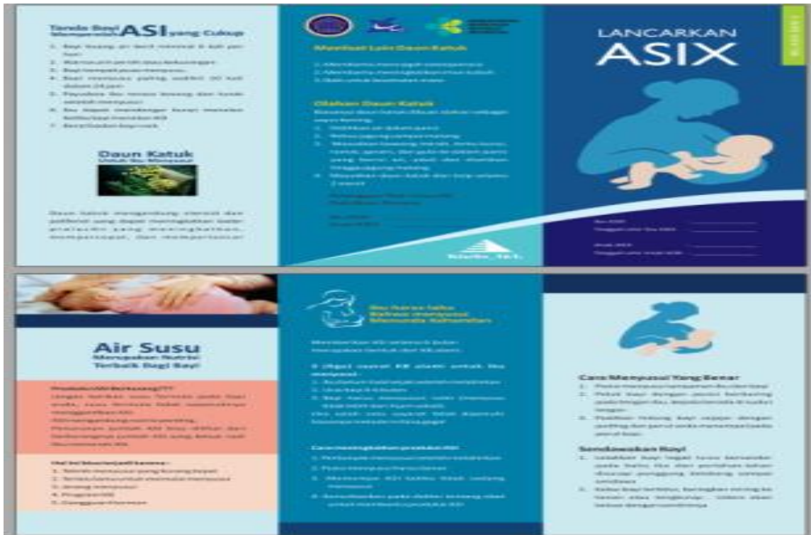
Figure 3. Serial leaflet 3