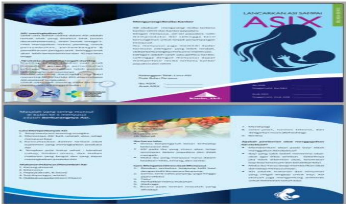
Figure 5. Serial leaflet 5