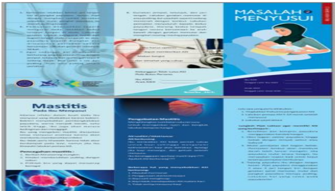
Figure 2. Serial leaflet 2